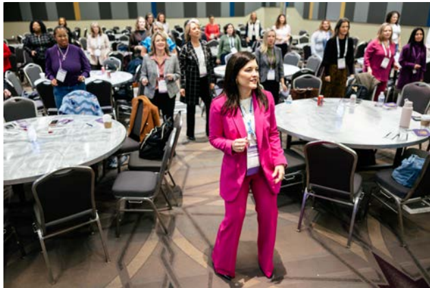
Special Award Recipients