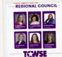
REGIONAL COUNCIL TOWSE Connection and Professional Growth

When: Tuesday, March 24 th 11-2pm Where: Region 13 Service Center