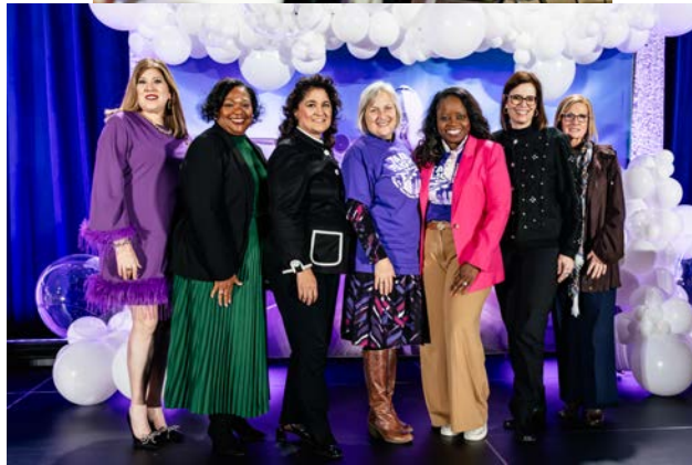
Always Time for Silent Auction and Shopping