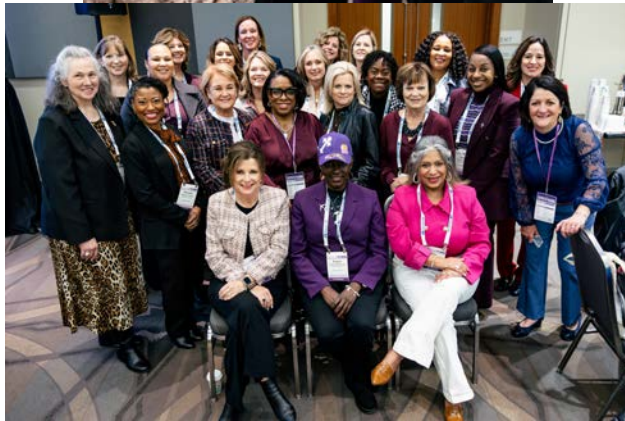
Superintendents 0-3 Years Experience