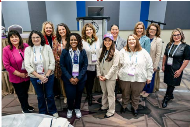
Superintendents 3-7 Years