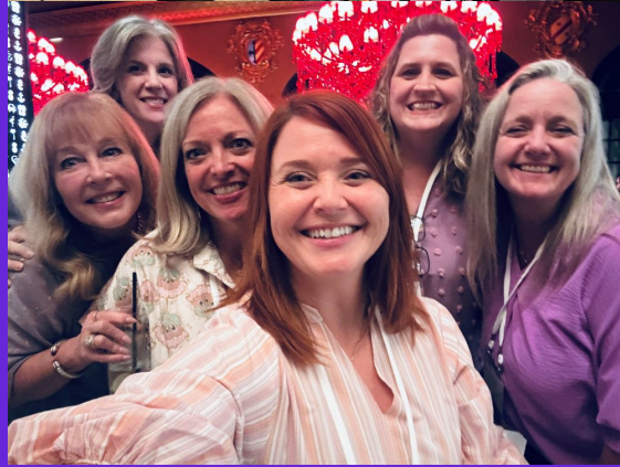
Officers and Regional Leaders for 2026-27