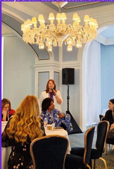
Reception Sponsored by PBK