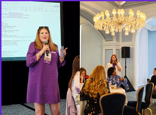
Learning our history, discussion and sharing of ideas